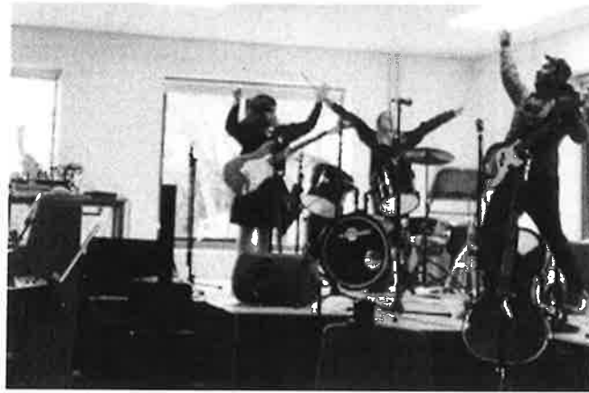
Pupils enjoying a music lesson in our well-equipped studio.

Music at the school is going from strength to strength, with over 110 pupils accessing music tuition each week. Our fully equipped music studio allows pupils to take part in a range of musical experiences, including playing, singing, producing new songs, mixing and stage lighting. The children have helped to identify new items that they would like for the studio and have worked tirelessly throughout the year to fundraise through their own performances and events. They have also supported other charities, such as Comic Relief, when they performed during pick up time at the school.