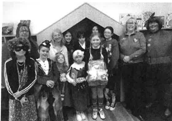
Pupils were grateful for the lovely books donated from Morrisons on World Book Day.

"Parents recognise the dedication of the headteacher, and the staff, to the welfare and education of every pupil. They feel that their children are known, nurtured, respected and valued". Ofsted March 2022